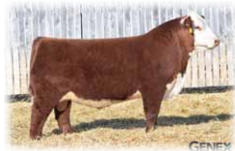
TH FRONTIER 174E Sire of Lot 32