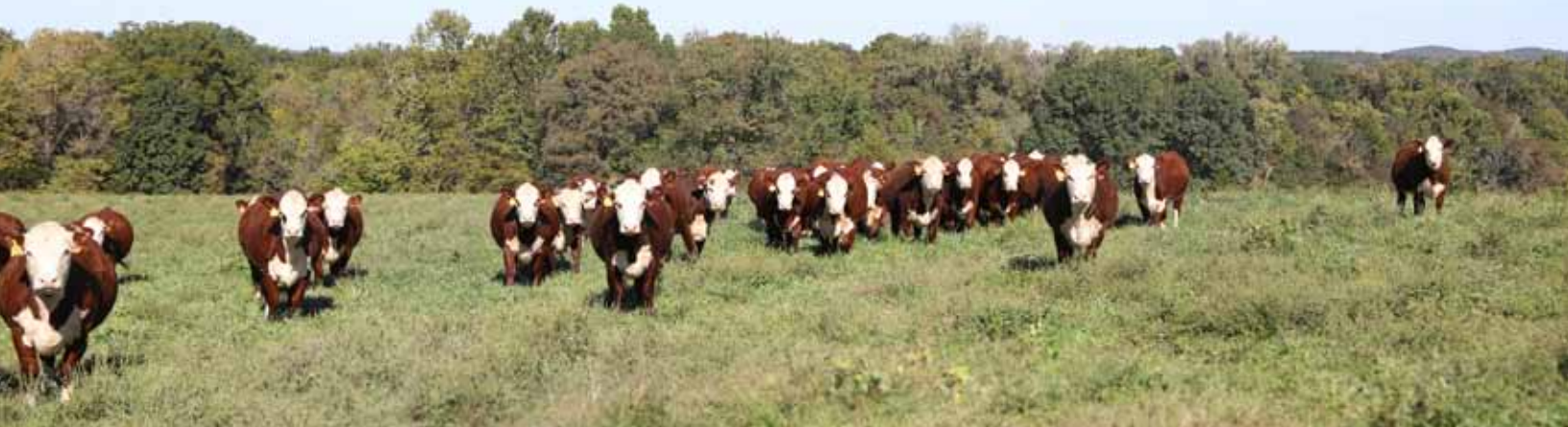
FTF Premier 072H - Sells as Lot 19