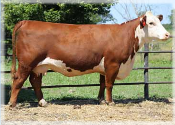
FTF Ms Revolution 6309D - Sells as Lot 42

Falling Timber Farm 16789 Ridder Road Marthasville, MO 63357