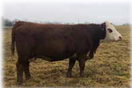
FTF CLASSY LADY 803U Dam of Lot 32, Pictured at 13 years old