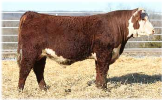
FTF RELEVANT 831F {DLF, HYF, IEF} P43911639 01/16/2018

Cattlemen take notice. This cow has a great udder, deep ribbed, and is an eye catcher, but just wait until you see how she can raise a calf! She records 3 calves with an average BW ratio of 96.3 and WW ratio of 109.3. She'll most likely be a DOD by sale day. Her first calf was FTF Relevant 831F, owned with Jordan Herefords and BEEF-360. He's the best calving ease bull we have ever used. We are 100% committed to selling our 5 year olds w/ heifer calves at side, otherwise this gal would not be offered for sale. Retaining 1/2 embryo interest in the cow and calf. Heifer calf, FTF Connie 172J, born 1/29/21, 65 lbs, sired by FTF Confidence 6113D at side.