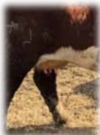
FTF ROSALINDA 573C Dam of Lot 2