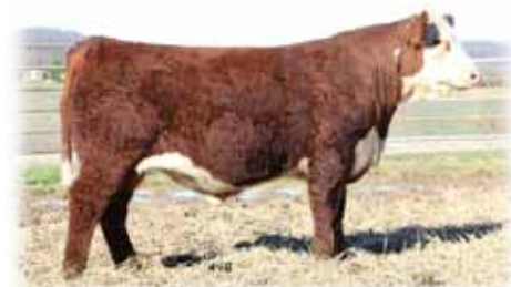
FTF PRIME PRODUCT 513C Maternal Grand sire of Lot 20