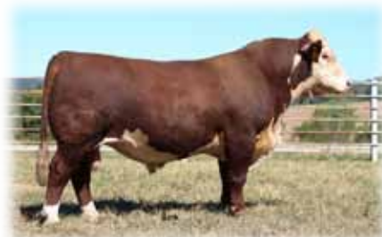
FTF REVOLUTION 2429Z ET Maternal Grandsire of Lot 2