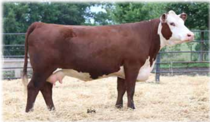
FTF VERONICA 227Z {DOD, DLF, HYF, IEF} P43289560 01/12/2012 Great granddam of Lot 9

034H is quite the beast. He is as well balanced as they come both phenotypically and from an EPD standpoint. His incredible performance ratios have every trait heading in the right direction. He's a linebred individual that is ready to be outcrossed and express extra performance. His dam is a beautiful two year old. Retaining ½ semen interest. Homozygous Polled. Top 10% WW, YW, 15% CED, Uddr, 20% SC, 30% Marb. SHOW-ME SELECT QUALIFIED.