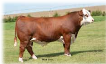
R LEADER 6964 Sire of Lot 1