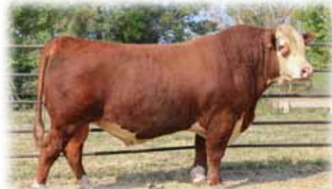
HUTH FTF TORQUE C002 Sire of Lot 2