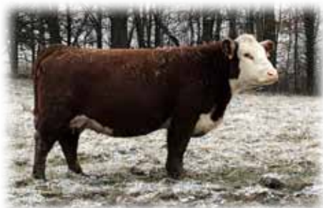
FTF MISS PROFIT 8403F Dam of Lot 20