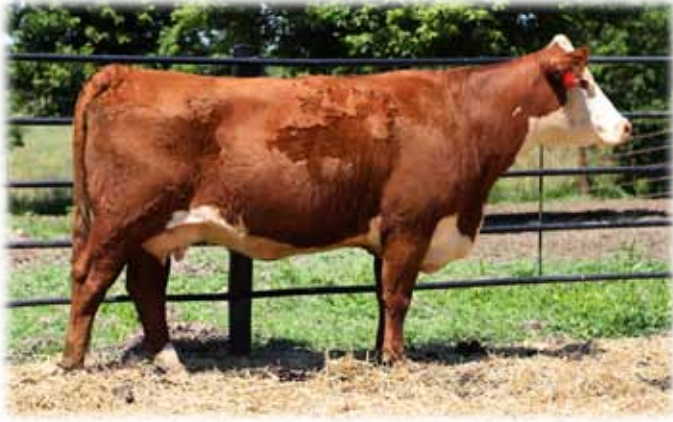
FTF MS RED 603D P43667051 01/08/2016 Granddam of Lot 74